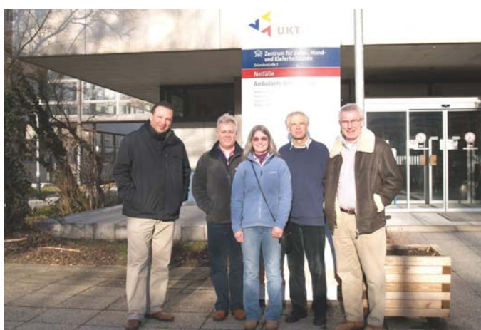
ESE executive members take the mid-day air in bright but chilly Tübingen

a mixed and very full agenda, that occupied all daylight hours (though punctuated by a brief lunchtime stroll), and extending until the night-time call for sustenance became irresistible.